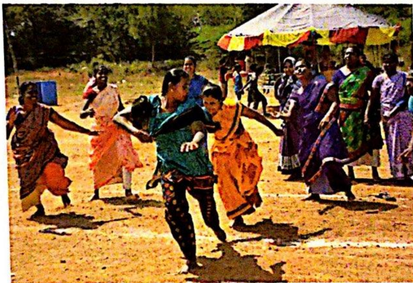
Fun-filled weekend:(clockwise from top left) Visitors try their hand at traditional games; some of the colourful items on display; a couple shops at one of the stalls and villagers enjoy a traditional game at the Puducherry Village Heritage Festival at Alankuppam in Puducherry on Sunday.